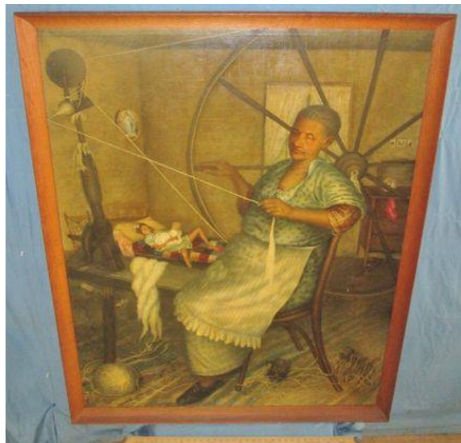
Dometer Guczul's "The Old Spinning Wheel" as it appeared in View above and below an image when offered for auction in 2014.